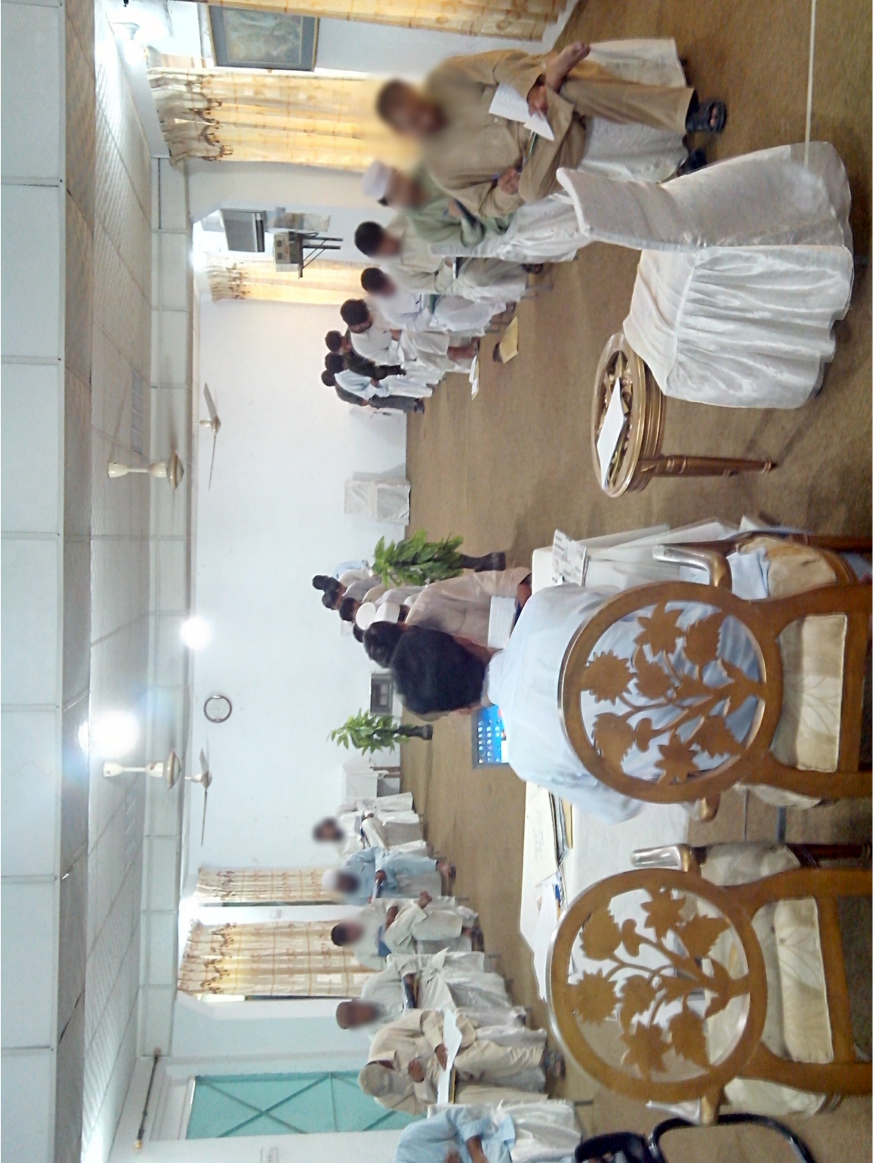
Figure A.5: Experiment Session in Peshawar