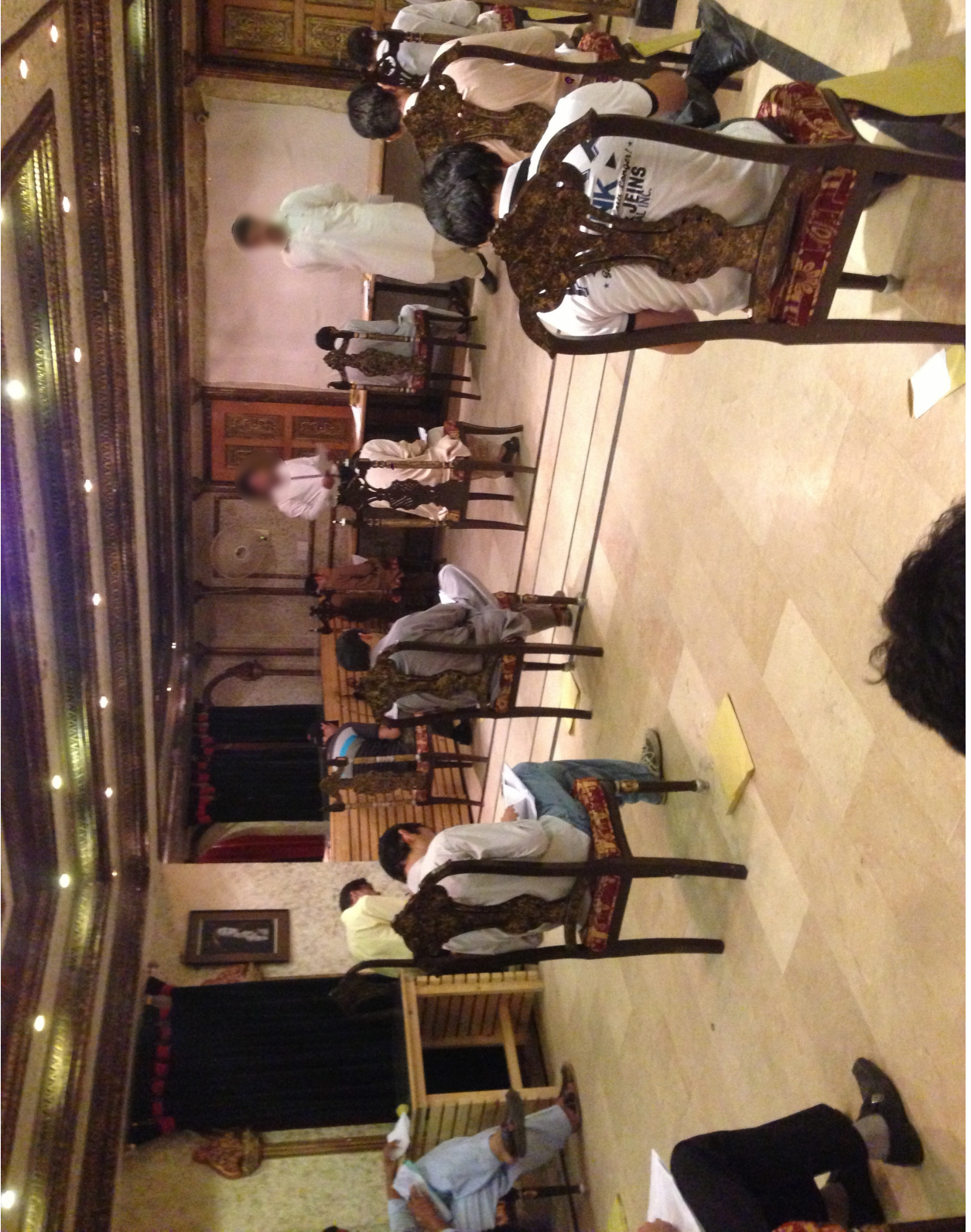
Figure A.4: Experiment Session in Islamabad